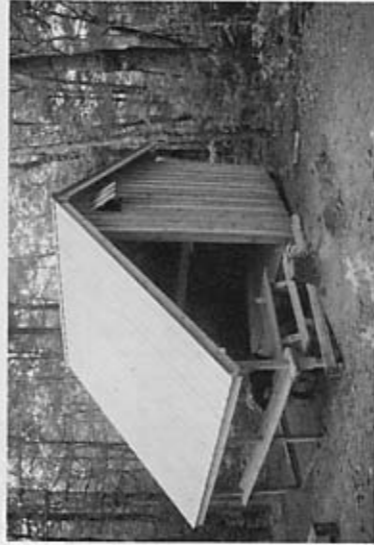
Gooch Mountain Shelter