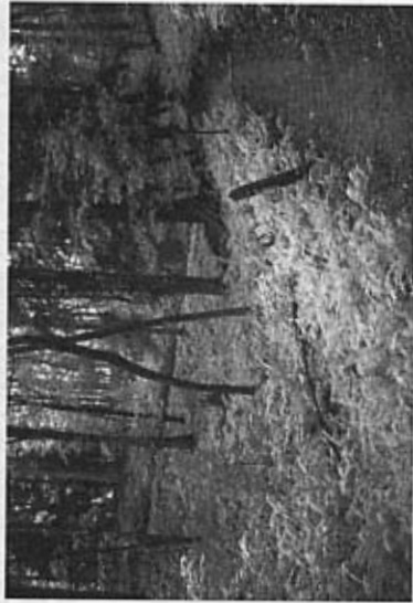
Trail near Hightower Gap